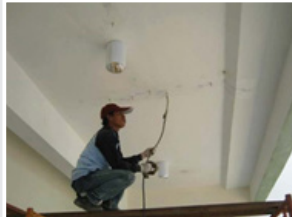
Trinity Towers Parking, Prabhadevi