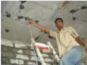
Trinity Towers Club, Prabhadevi