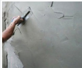
INTONACO Smooth application