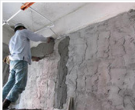
INTONACO Rough application