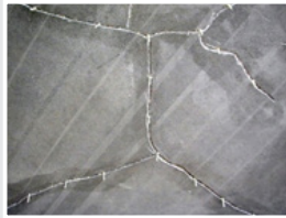
EPIKOTE LV injected