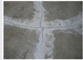
EPIKOTE LV excess grind off