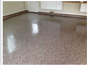
Coloured Chip Finish